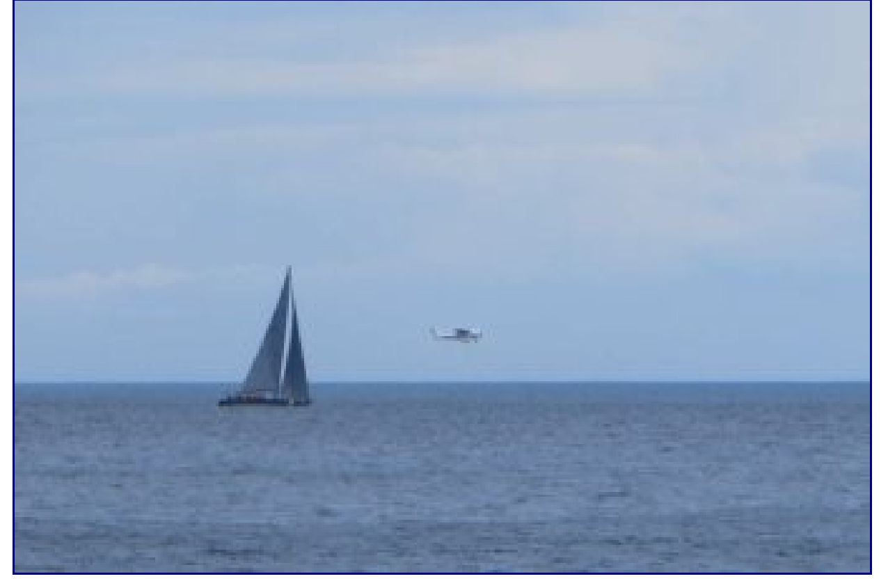
Photo: A photo taken by a Sydney to Hobart yacht race spectator is believed to show the plane.

A plane that crashed near Cape Raoul off the Tasman Peninsula on Monday has been found at the bottom of the sea, Tasmanian Police have confirmed.