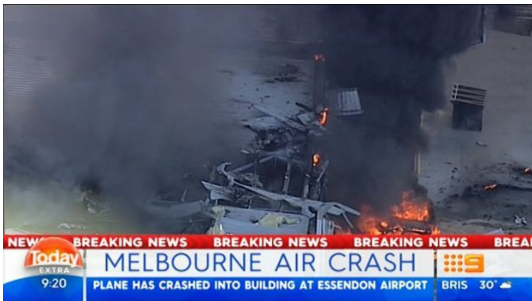
Plane crash at Essendon DFO

"It was taking off to the right off the runway, it did not come over the freeway at all."