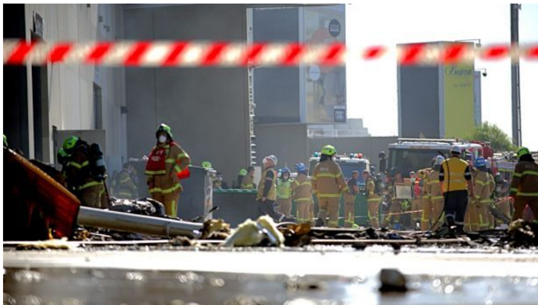
Firefighters at the scene in Essendon.