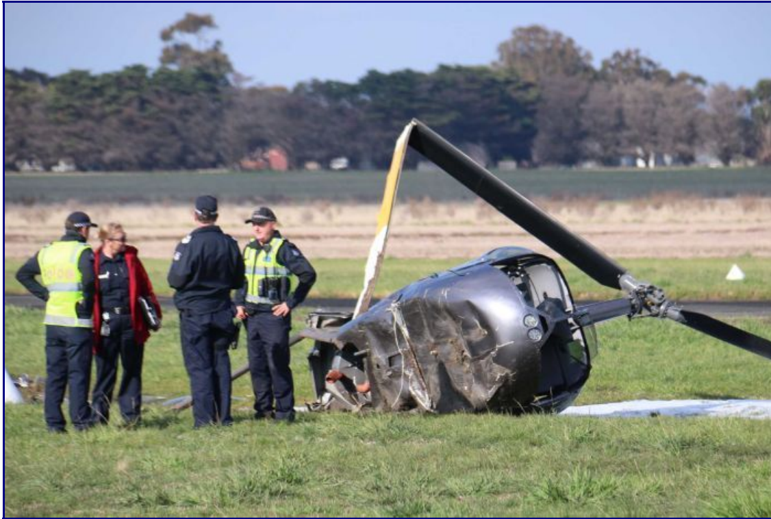
Photo: The Robinson R44 was doing circuits at the time of the crash.

Two people have escaped serious injury after a helicopter crashed while doing circuits near a regional Victorian airport.