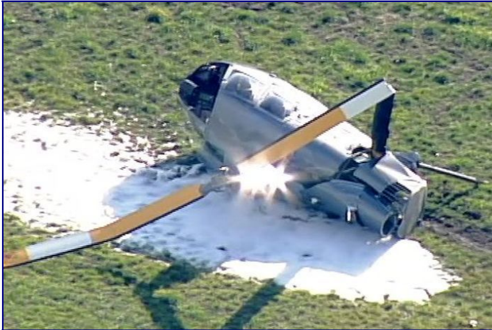
Photo: Debris from the crash was scattered across the area. (ABC News)

It is commonly used for flight training, private use and by pastoralists.