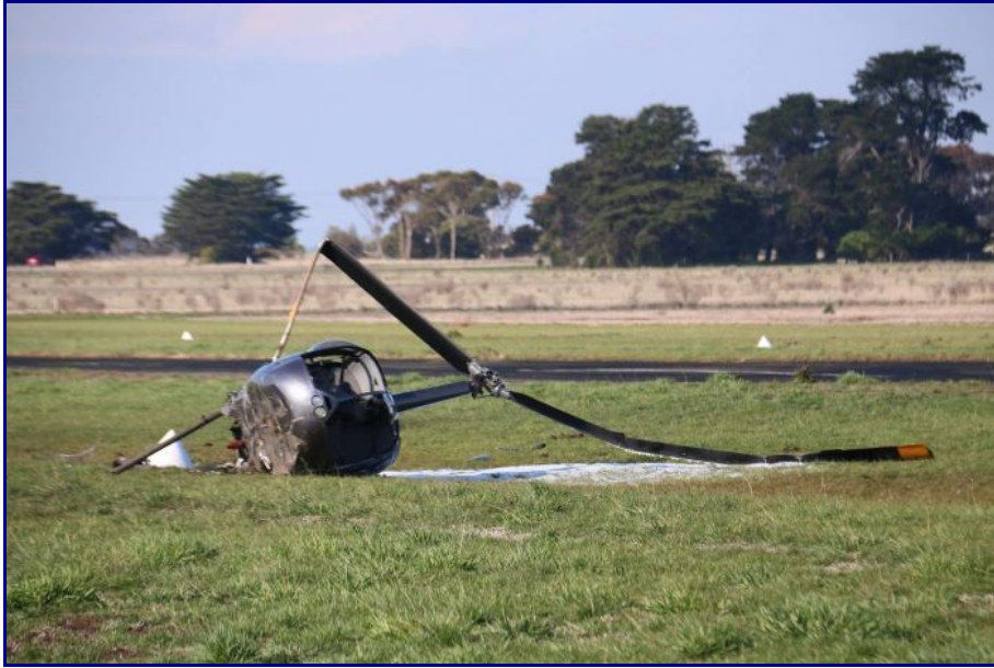
Photo: The crash destroyed everything but the cabin the two men were in.

"The pilot's got into some difficulty and the helicopter's hit the ground reasonably hard. It's bounced a short distance and come to rest on its side," he said.