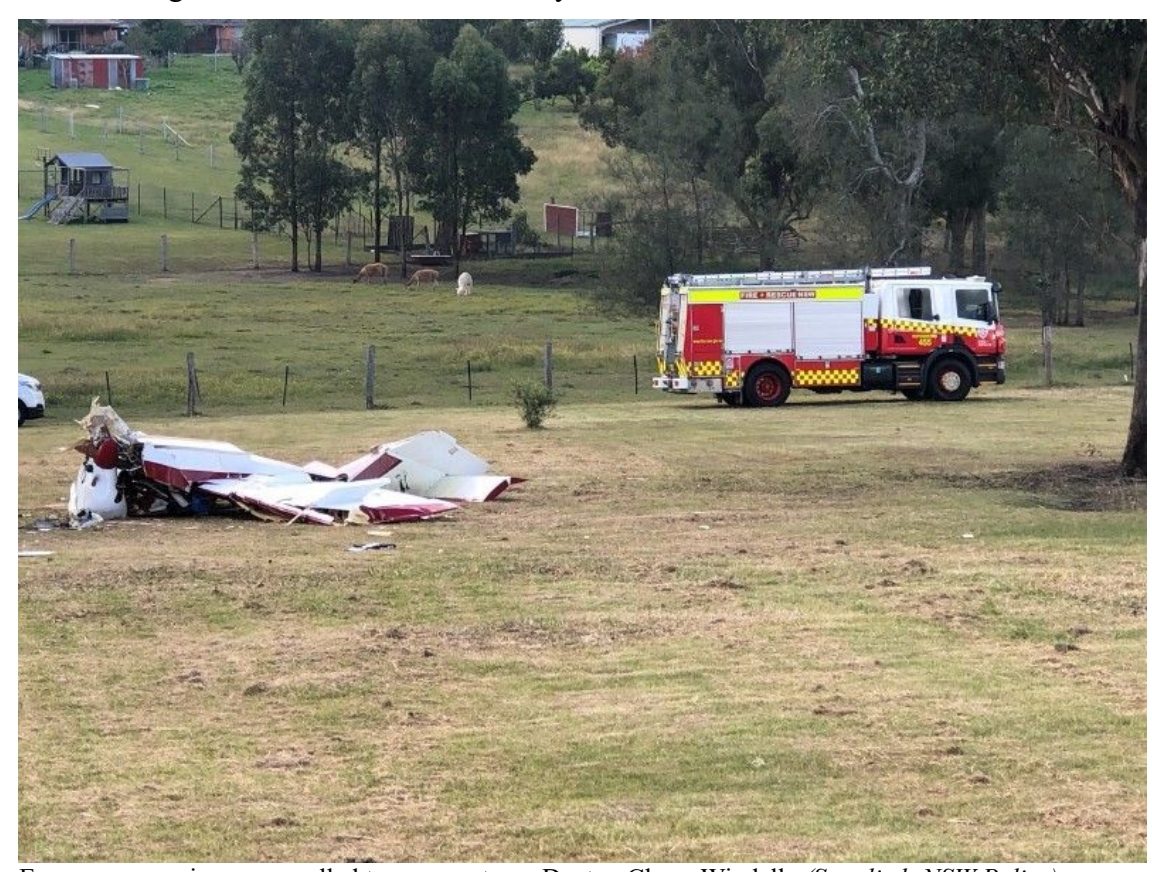
Emergency services were called to a property on Denton Close, Windella.

The wreckage was located close to the Royal Newcastle Aero Club.